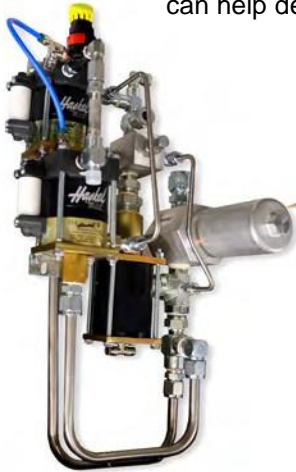
Plate Shifters and Retrofits

Replacement hydraulic components and air and hydraulic module assemblies are in stock.