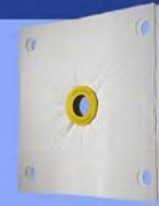
Recessed Chamber Non-Gasketed