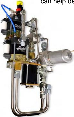
Plate Shifters and Retrofits

Replacement hydraulic components and air and hydraulic module assemblies are in stock.