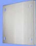
Plate & Frame