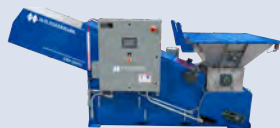
M.W. Watermark Continuous Sludge Dryer