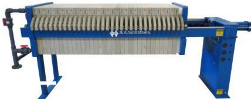
- Fig.1 - Filter press operating at full capacity