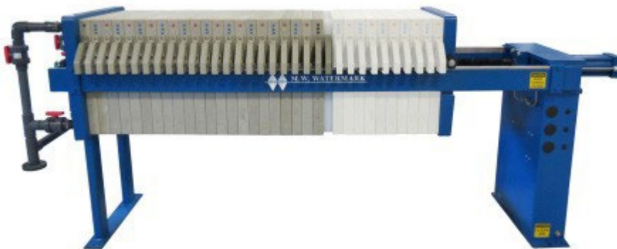
- Fig.3 - Filter press operating at reduced capacity