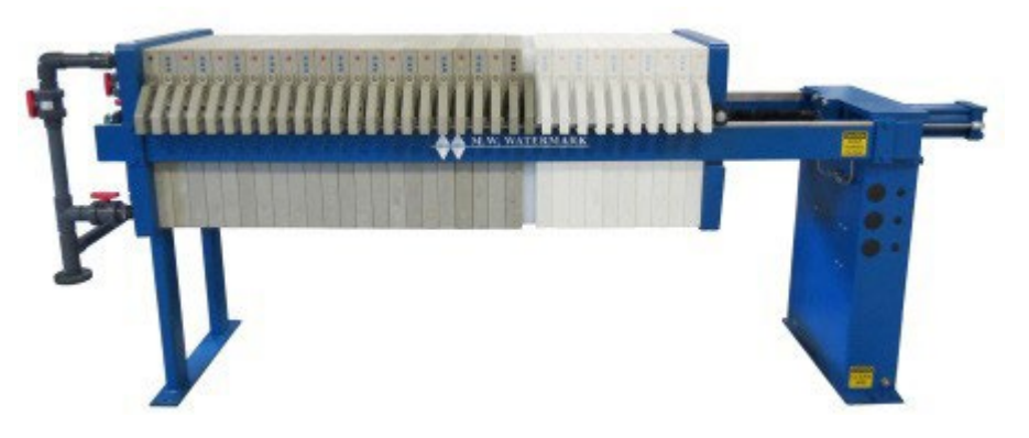
Fig.3 - Filter press operating at reduced capacity

Fig.2 - Tail and blanking plates moved forward in the plate stack