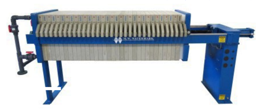
Fig.1 - Filter press operating at full capacity

VIDEO: Reduce Filter Press Capacity Using a Blanking Filter Plate