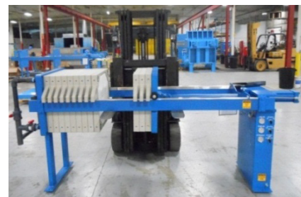
Figure 2: Lifting Press with Fork Lift