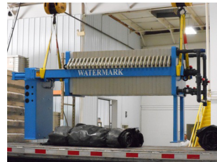
Figure 1: Press Rigging Using Sidebars 800mm and Smaller Presses

If appropriate rigging equipment is not available for overhead lift, a forklift can be used to lift and transport a filter press 800mm and smaller. The filter press has been shipped in the clamped position to hold the filter plates during shipping. Un-clamp using the press hydraulic controls (compressed air may be required, see instructions on next page) to retract the cylinder. Slide the filter plates toward the retracted follower to allow room for a fork from the lift truck. Pick up the filter press from under the side bars as shown in Figure 2. 630mm filter presses equipped with semi-automatic plate shifters may require the use of wood blocks beneath the sidebars to ensure the forklift tines do not bend the shifter rails. Be sure to lift near the center of the filter press to prevent the press from tipping. Verify load balance before moving the press.