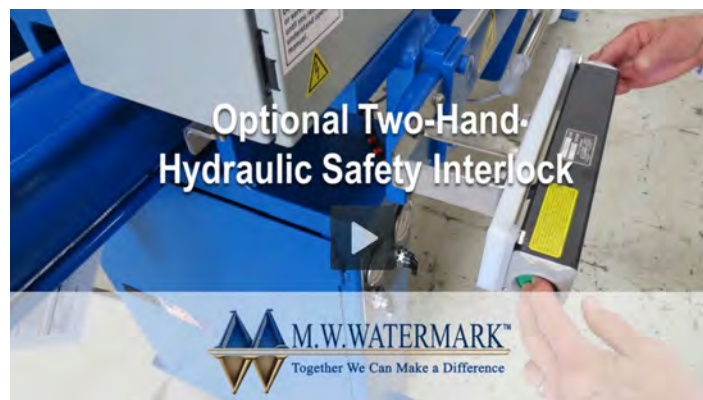
Click to Watch Video