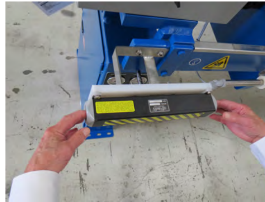
The Safety Buttons on Each Side Are Recessed to Help Prevent Operator Override