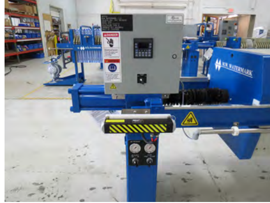
M.W. Watermark 630mm Filter Press with Optional Two-Hand Hydraulic Safety Interlock