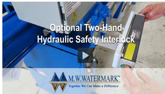
Click to Watch Video