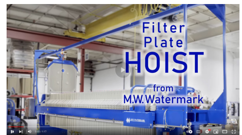
VIDEO Filter Plate Hoist

This functionality means that a single person can move large plates, simplifying the process of changing cloths. The filter press hoist comes with two motor options - air and electric - to suit different requirements.