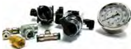
Plate Shifters and Retrofits

Gauges, switches, and valves or complete replacement control panels are in inventory, specified to match original components for quick, easy replacements or upgrades.