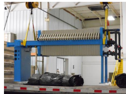
Figure 1: Press Rigging Using Sidebars 800mm and Smaller Presses

If appropriate rigging equipment is not available for overhead lift, a forklift can be used to lift and transport the filter press. The filter press has been shipped in the clamped position to hold the filter plates. Un-clamp using the press (see instructions on next page) to retract the cylinder. Slide the filter plates toward the retracted follower to allow room for a fork from the lift truck. Pick up the filter press from under the side bars as shown in Figure 2. Be sure to lift near the center of the filter press to prevent the press from tipping. Verify load balance before moving the press.