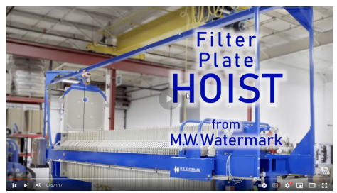
VIDE0 Filter Plate Hoist

This functionality means that a single person can move large plates, simplifying the process of changing cloths. The filter press hoist comes with two motor options – air and electric – to suit different requirements.